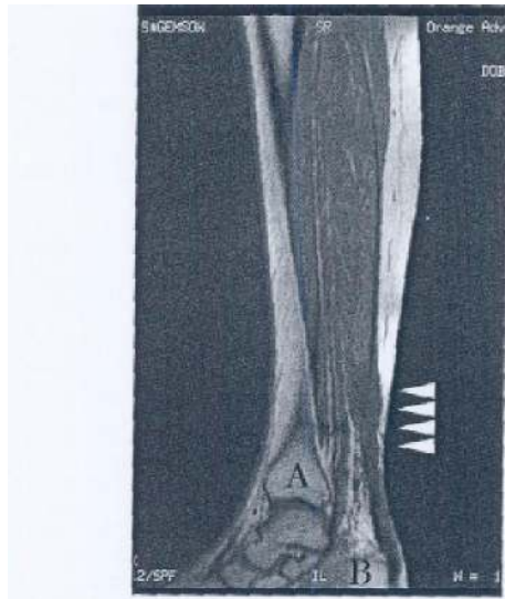
AT2, sagittal magnetic resonance image of the Achilles tendon on day 43 demonstrating interrupted, thickened hemorrhagic and gapped fibers of the tendon which is consistent with a full thickness tear [arrowheads]. A, tibia; B, calcaneus.