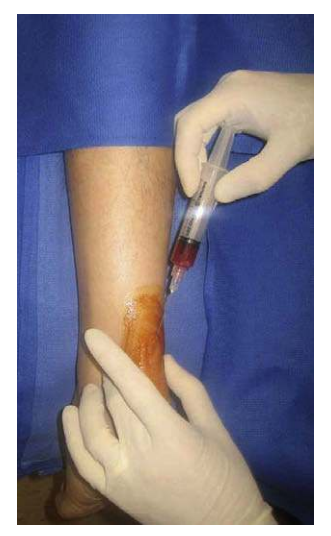
Fig. 3. PRP injection for chronic Achilles tendinopathy.

Muscle healing, like tendon healing, occurs in a series of overlapping phases, including inflammation, proliferation, and remodeling. These events are also