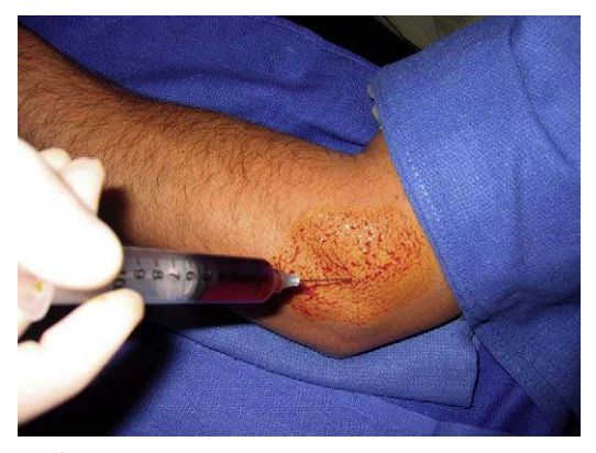
Fig. 2. Injection of PRP for chronic elbow tendinosis.

Anitua and colleagues<sup>45</sup> found faster recovery in athletes undergoing PRPenhanced Achilles tendon repair. In their study, athletes treated with surgery and PRP were compared with a retrospective control group of athletes treated with surgery alone. The PRP patients recovered range of motion earlier, had no wound complications, and returned to training activities in less time than control patients. The cross-sectional area of the PRP-treated tendons was also smaller than that in nontreated tendons when measured by ultrasound. Randelli and colleagues<sup>49</sup> recently